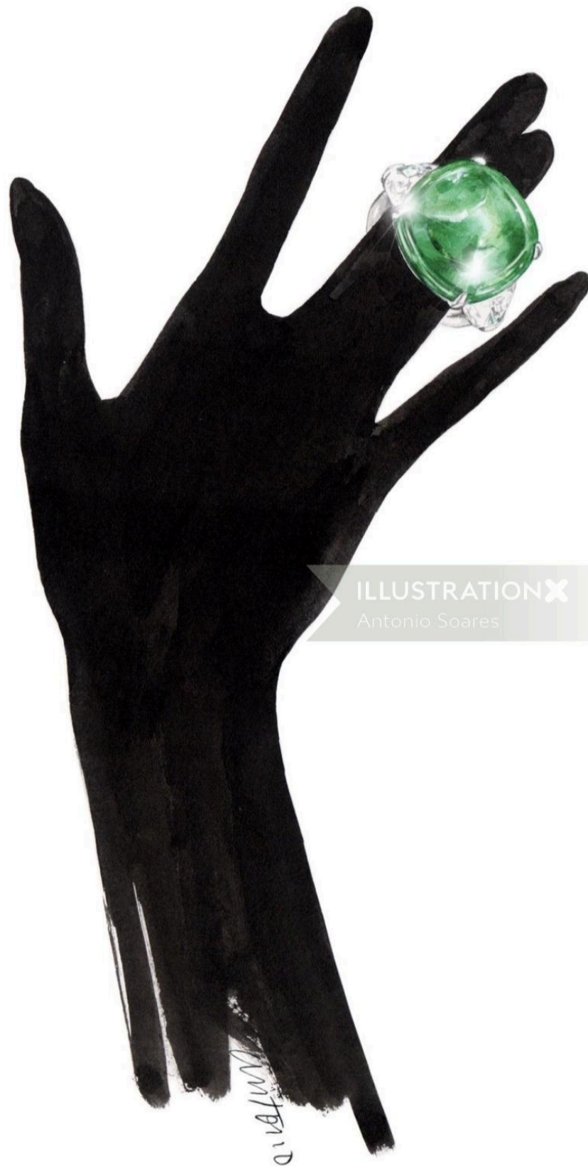
ILLUSTRATION X Antonio Soares