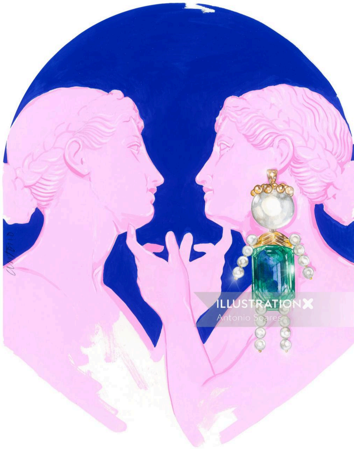
ILLUSTRATION X Antonio Soares