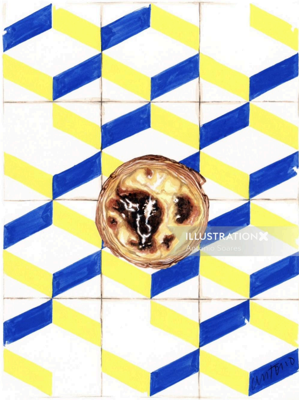
ILLUSTRATION X Antonio Soares