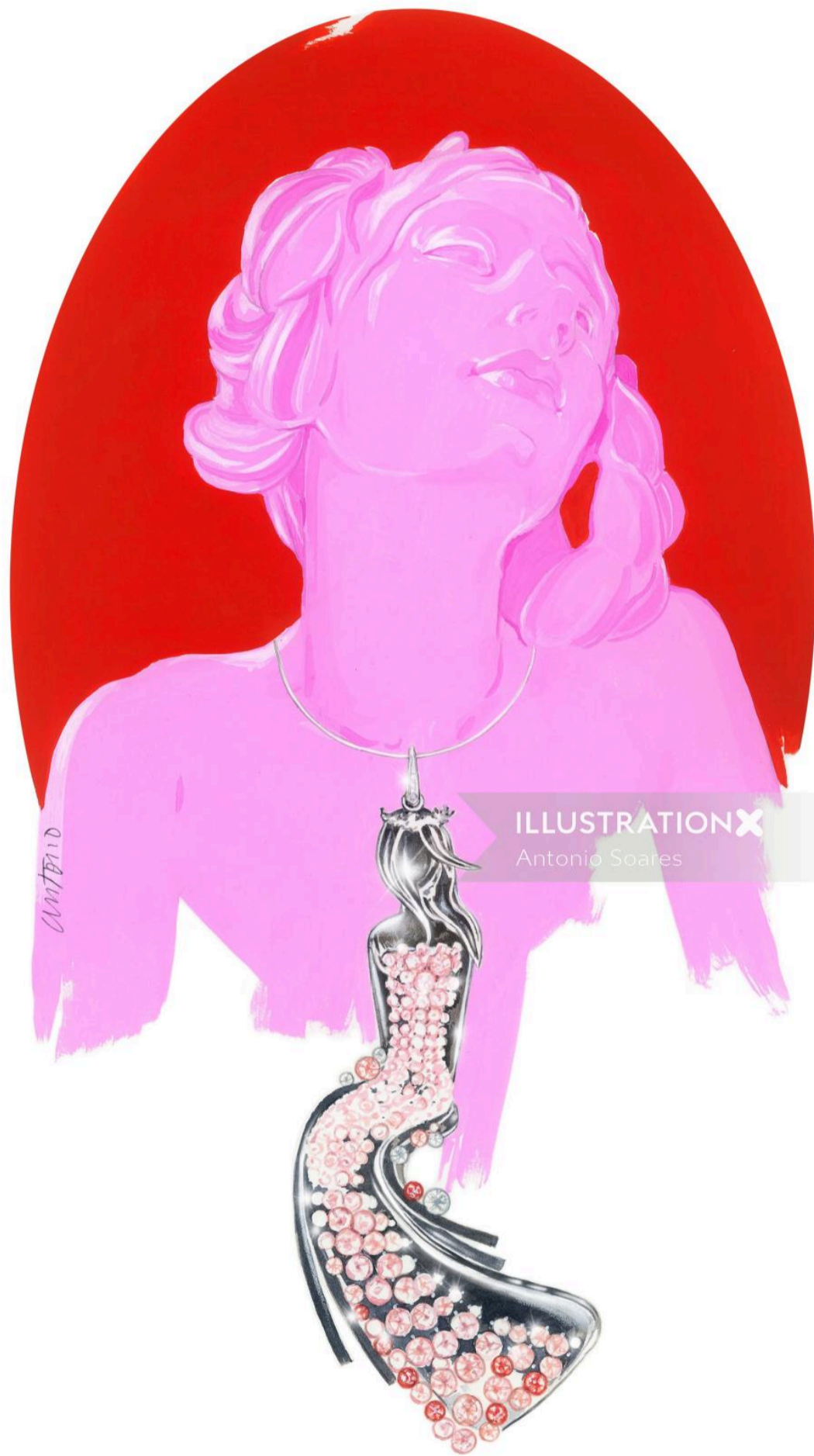
ILLUSTRATION X Antonio Soares