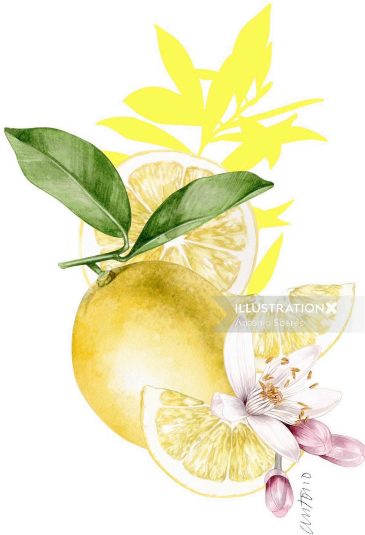
ILLUSTRATION X Antonio Soares