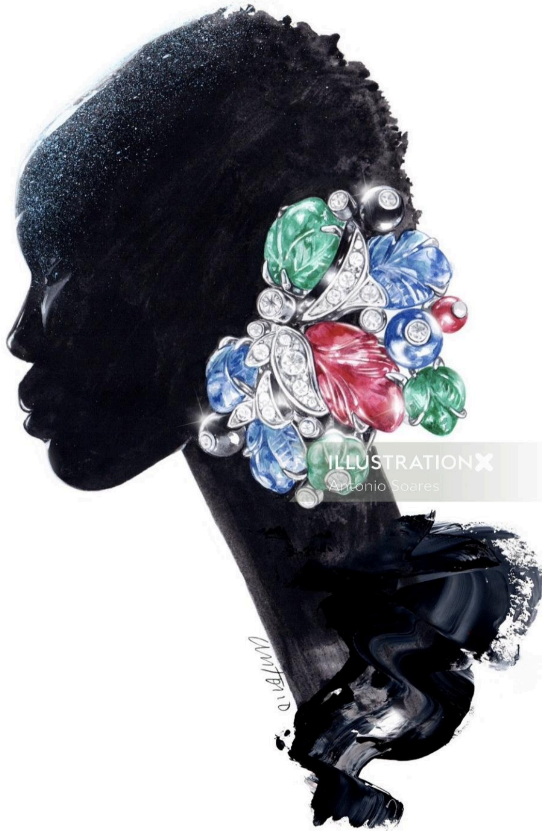
ILLUSTRATION X Antonio Soares