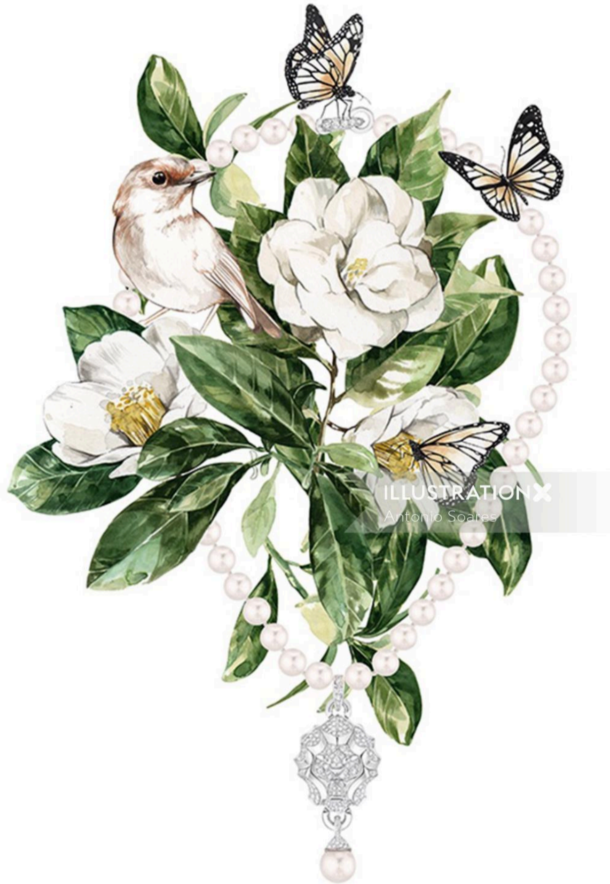
ILLUSTRATION X Antonio Soares