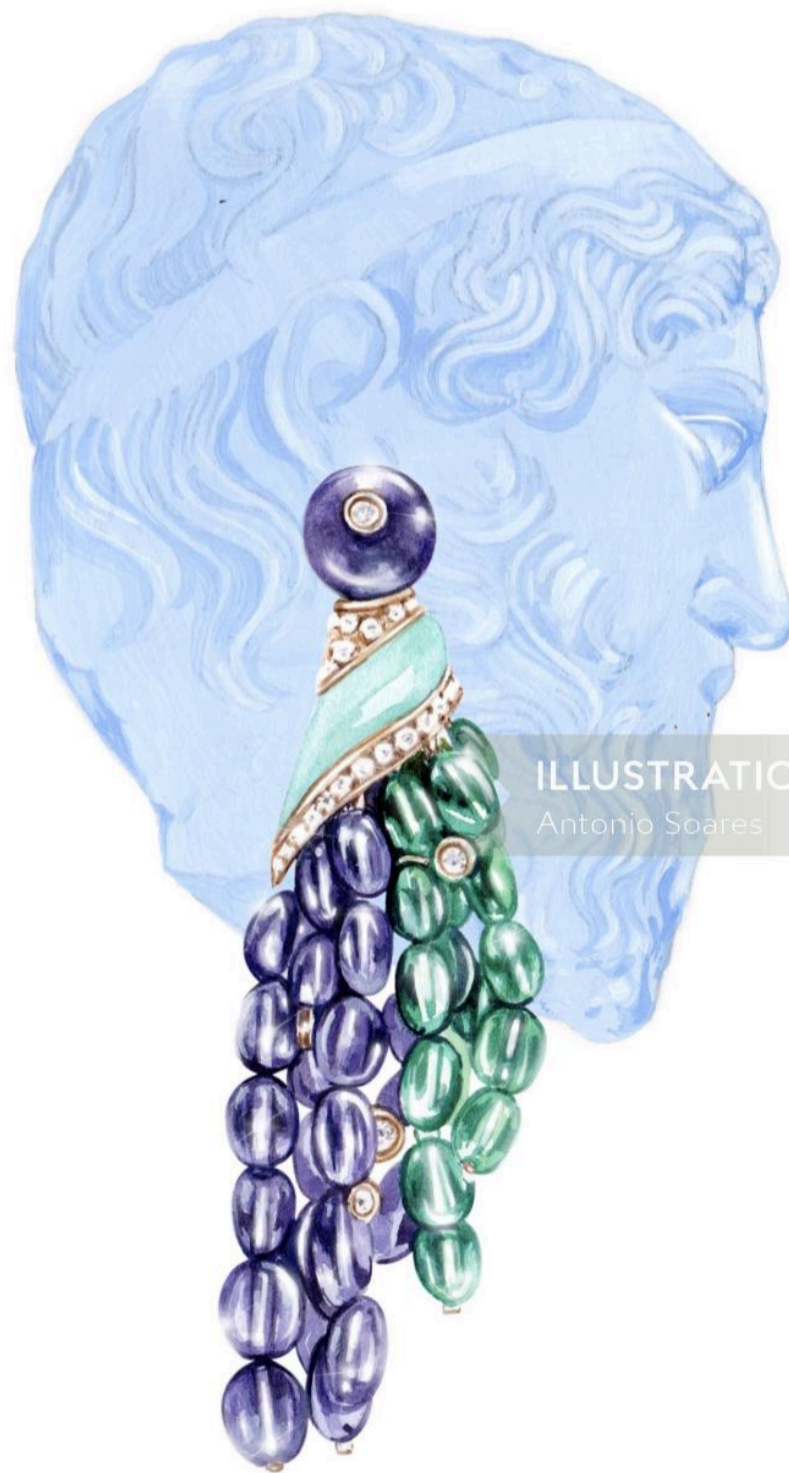
ILLUSTRATION X Antonio Soares