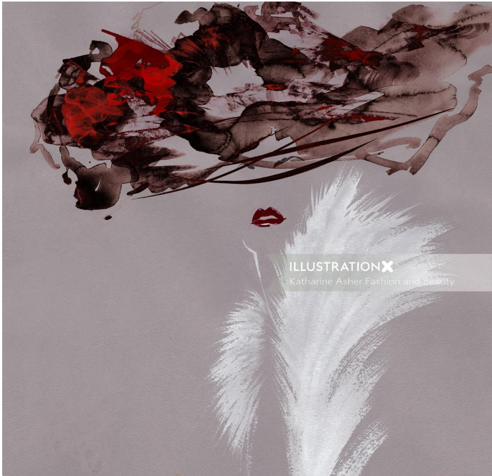
ILLUSTRATION X Katharine Asher Fashion and Beauty

www.illustrationx.com/uk/KatharineAsherFashionandBeauty