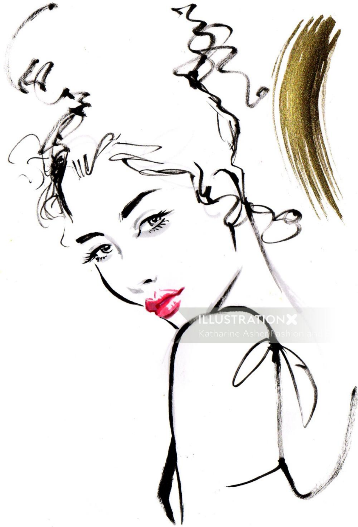
ILLUSTRATION X Katharine Asher Fashion and Beauty

www.illustrationx.com/uk/KatharineAsherFashionandBeauty