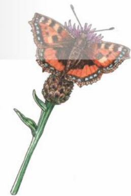
ILLUSTRATION X Liz Pepperell