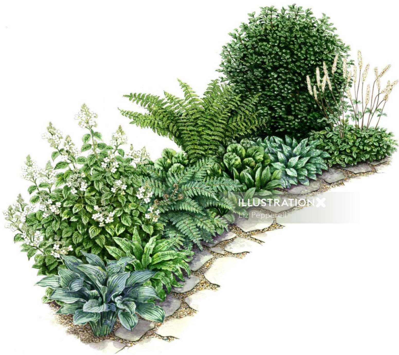
ILLUSTRATION X Liz Pepperell