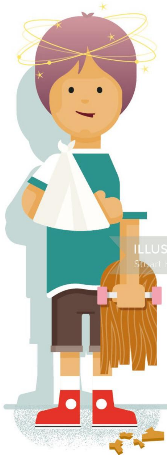
ILLUSTRATION X Stuart Holmes