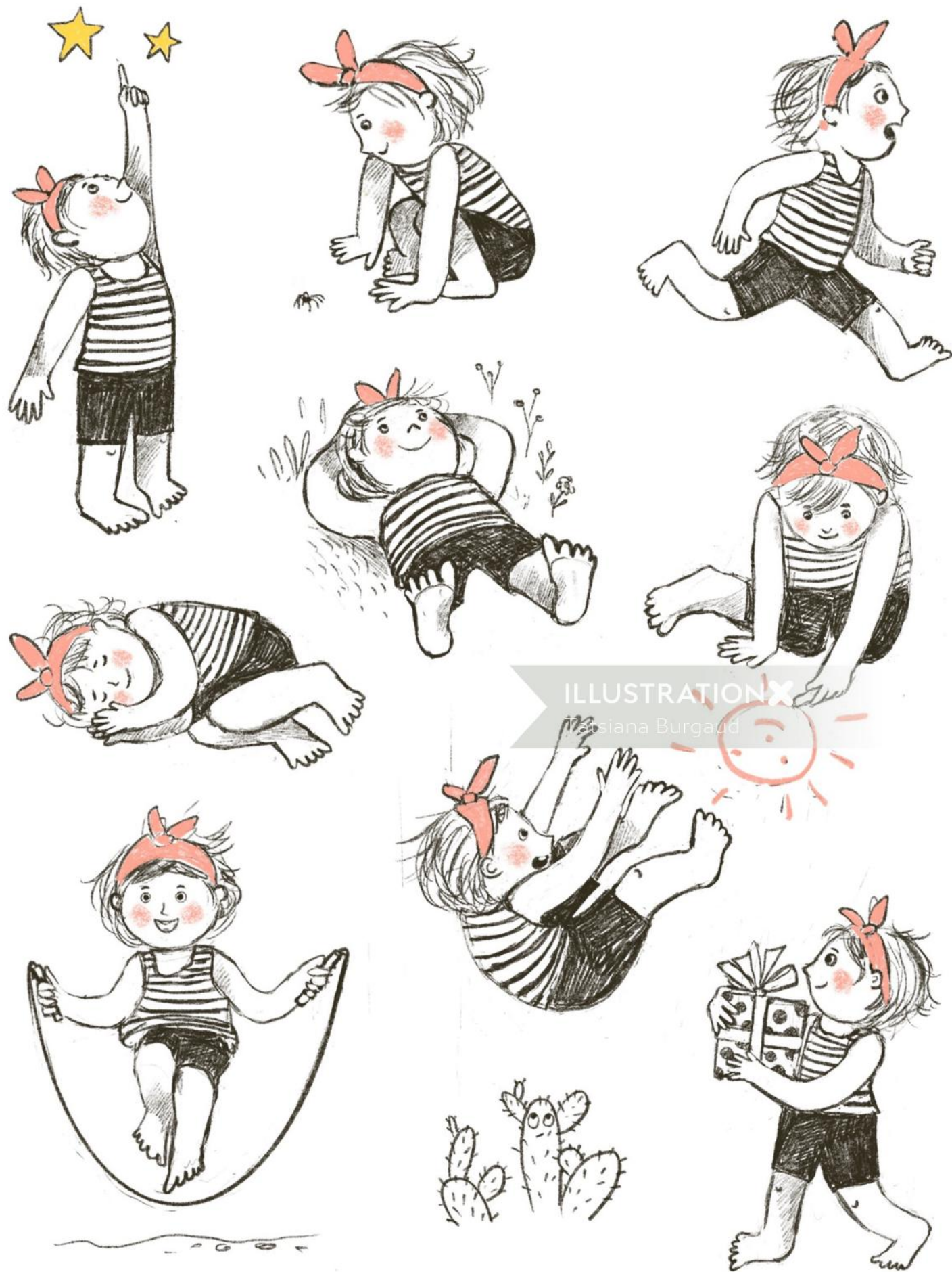
ILLUSTRATION X Tatsiana Burgaud

www.illustrationx.com/jp/TatsianaBurgaud