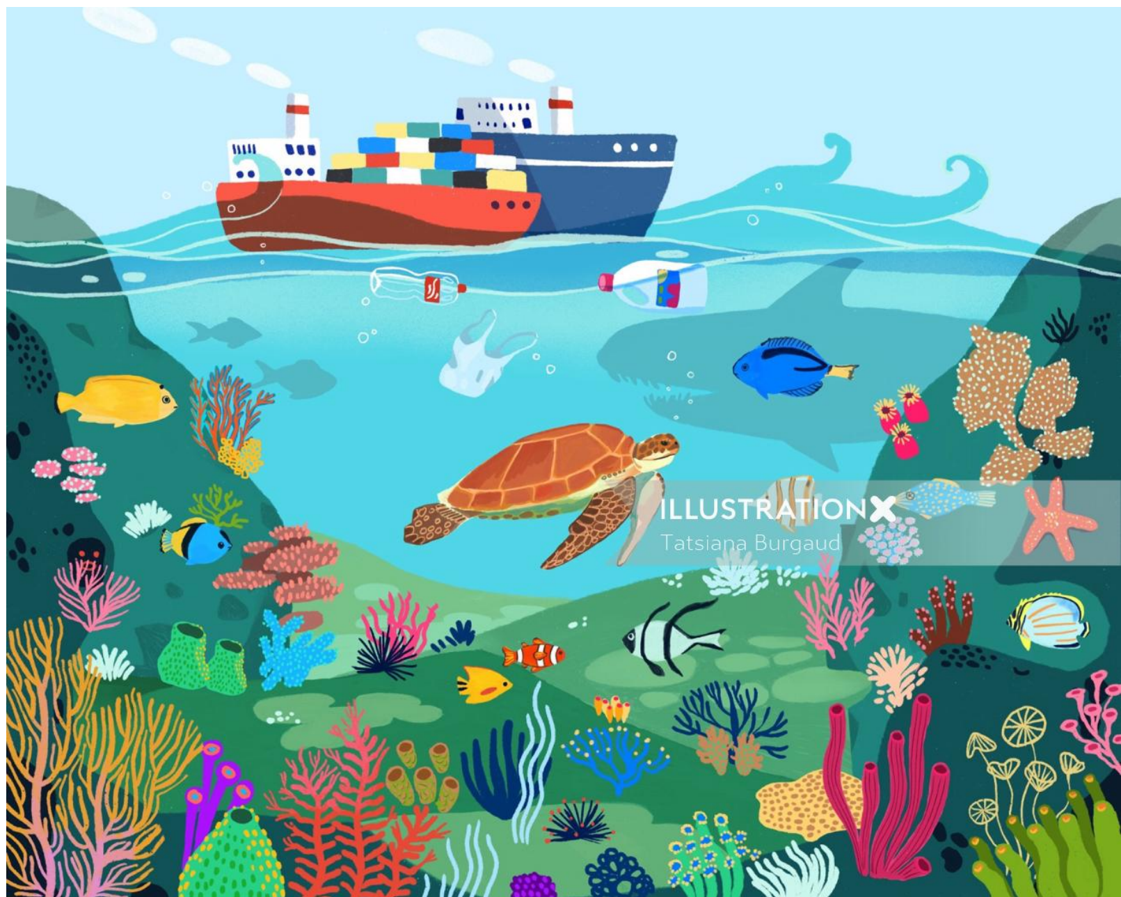
ILLUSTRATION X Tatsiana Burgaud

www.illustrationx.com/jp/TatsianaBurgaud