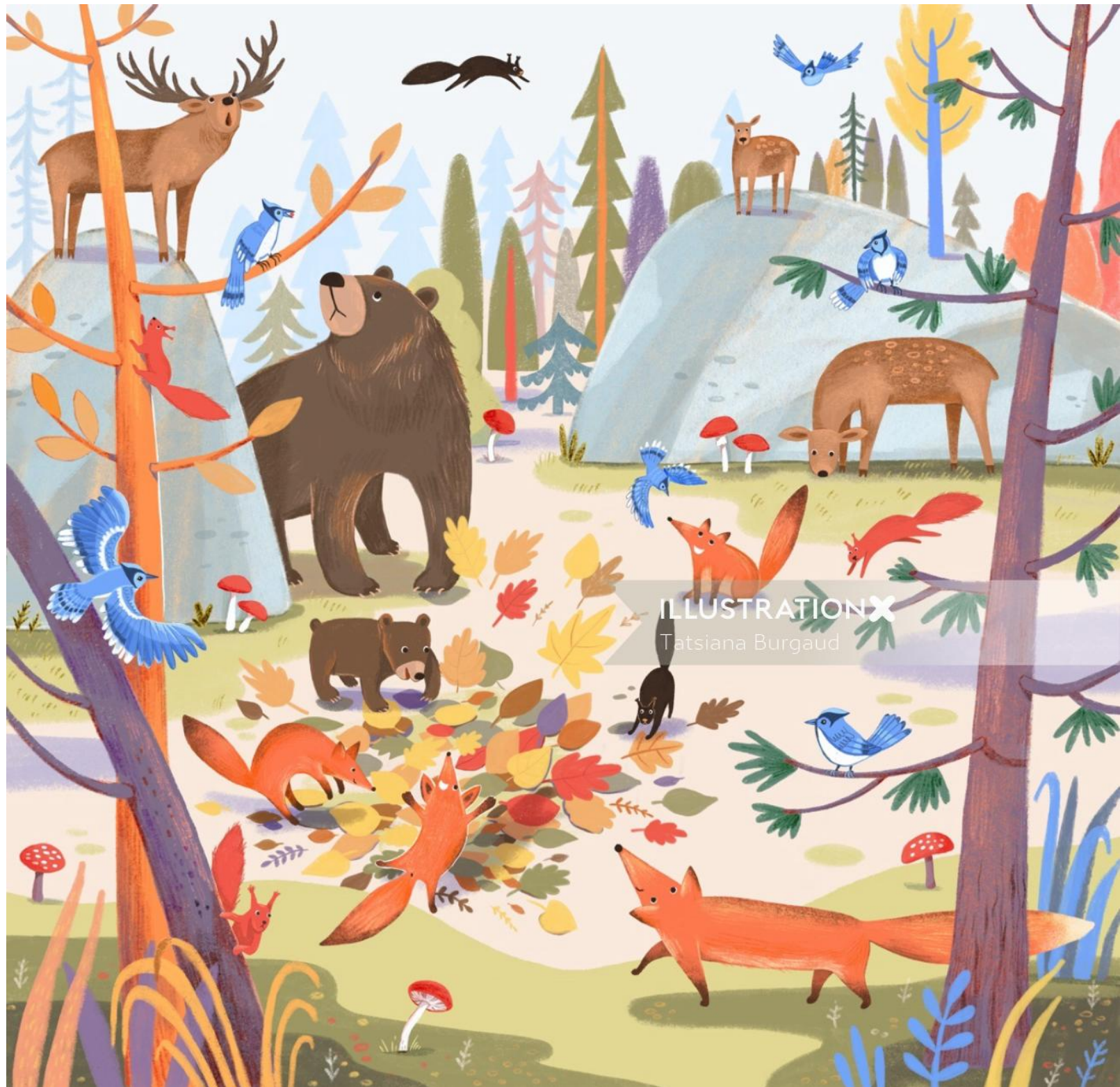
ILLUSTRATION X Tatsiana Burgaud

www.illustrationx.com/jp/TatsianaBurgaud