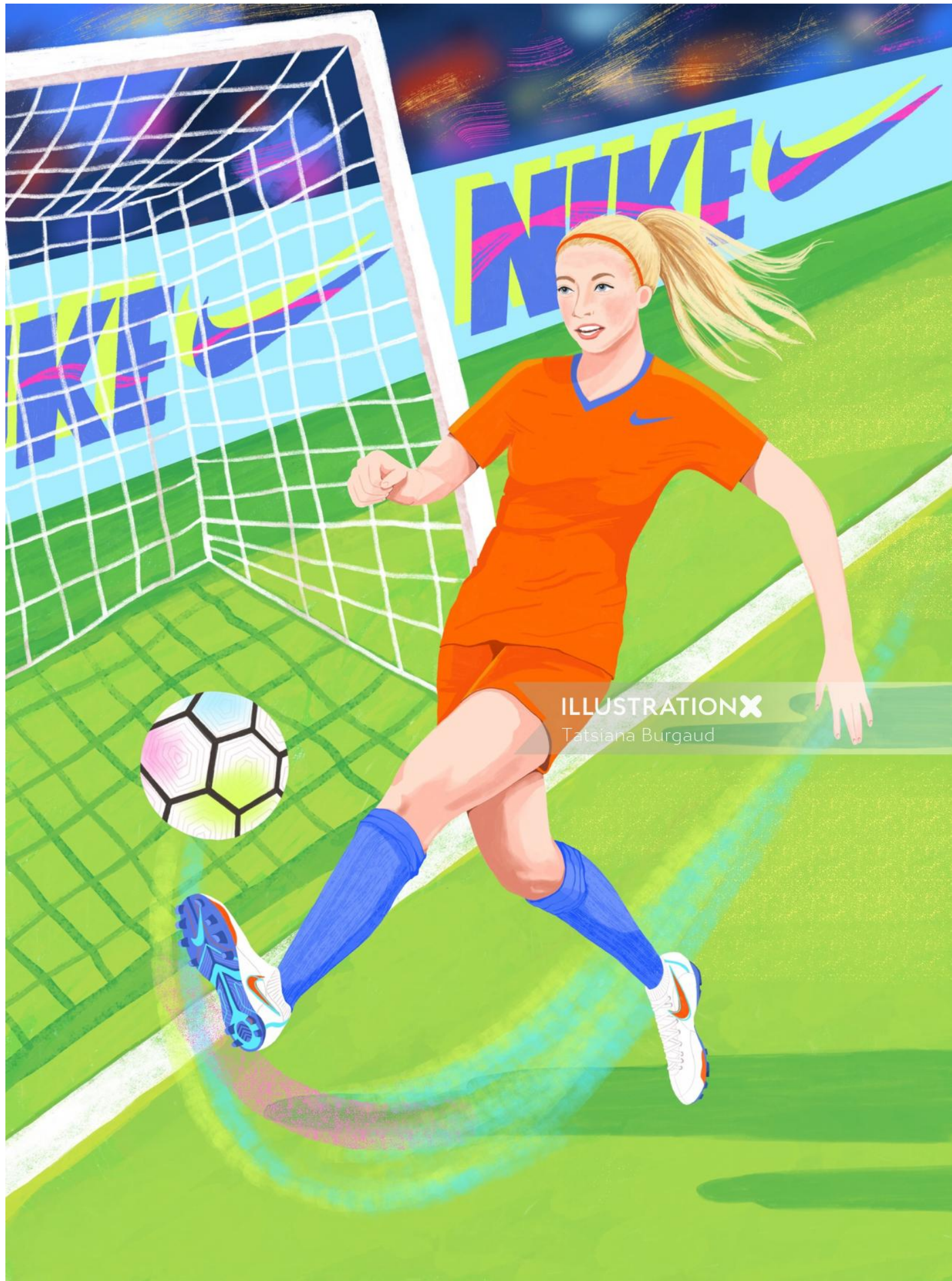
ILLUSTRATION X Tatsiana Burgaud

www.illustrationx.com/sx/TatsianaBurgaud