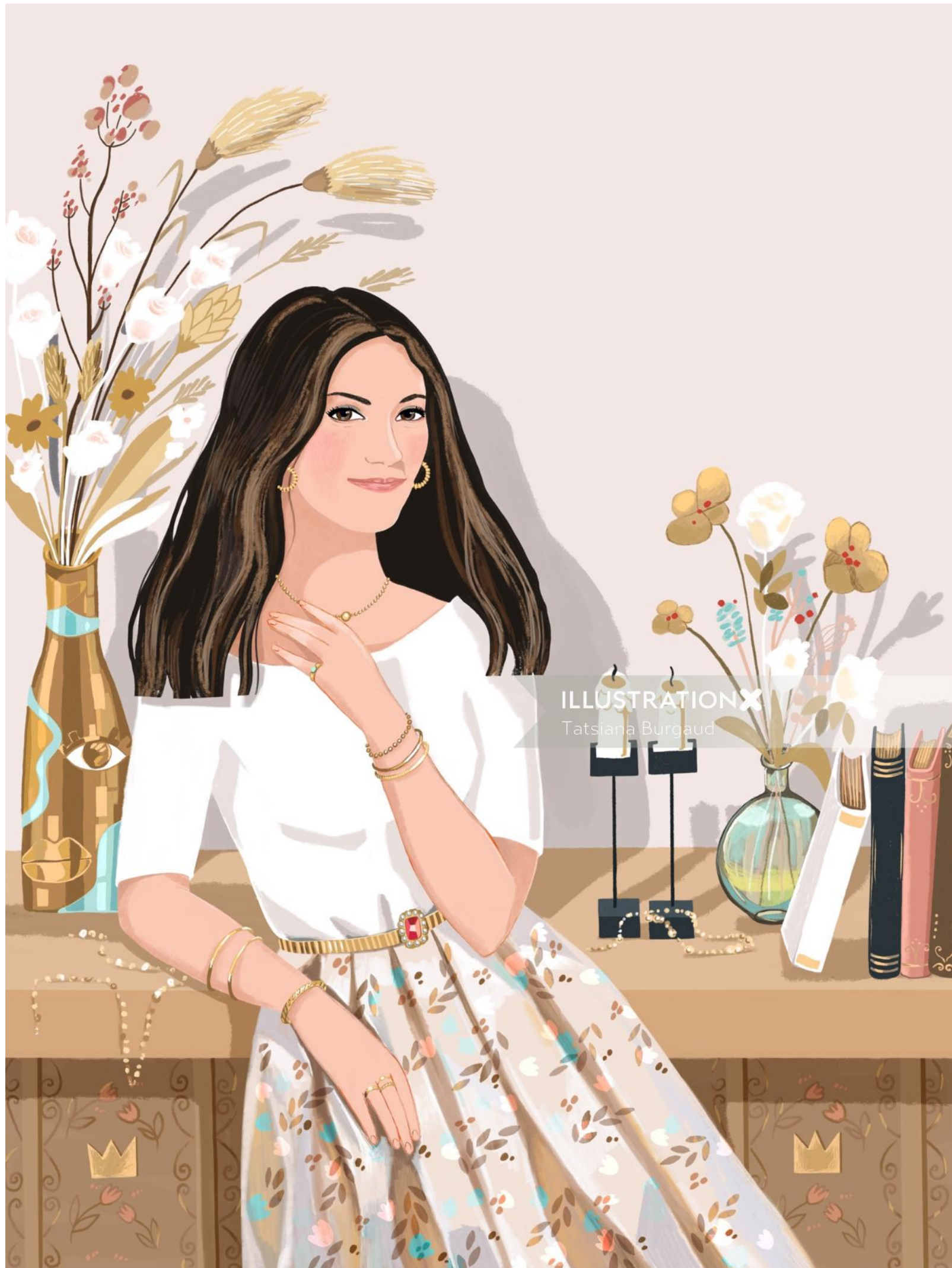
ILLUSTRATION X Tatsiana Burgaud

www.illustrationx.com/sx/TatsianaBurgaud