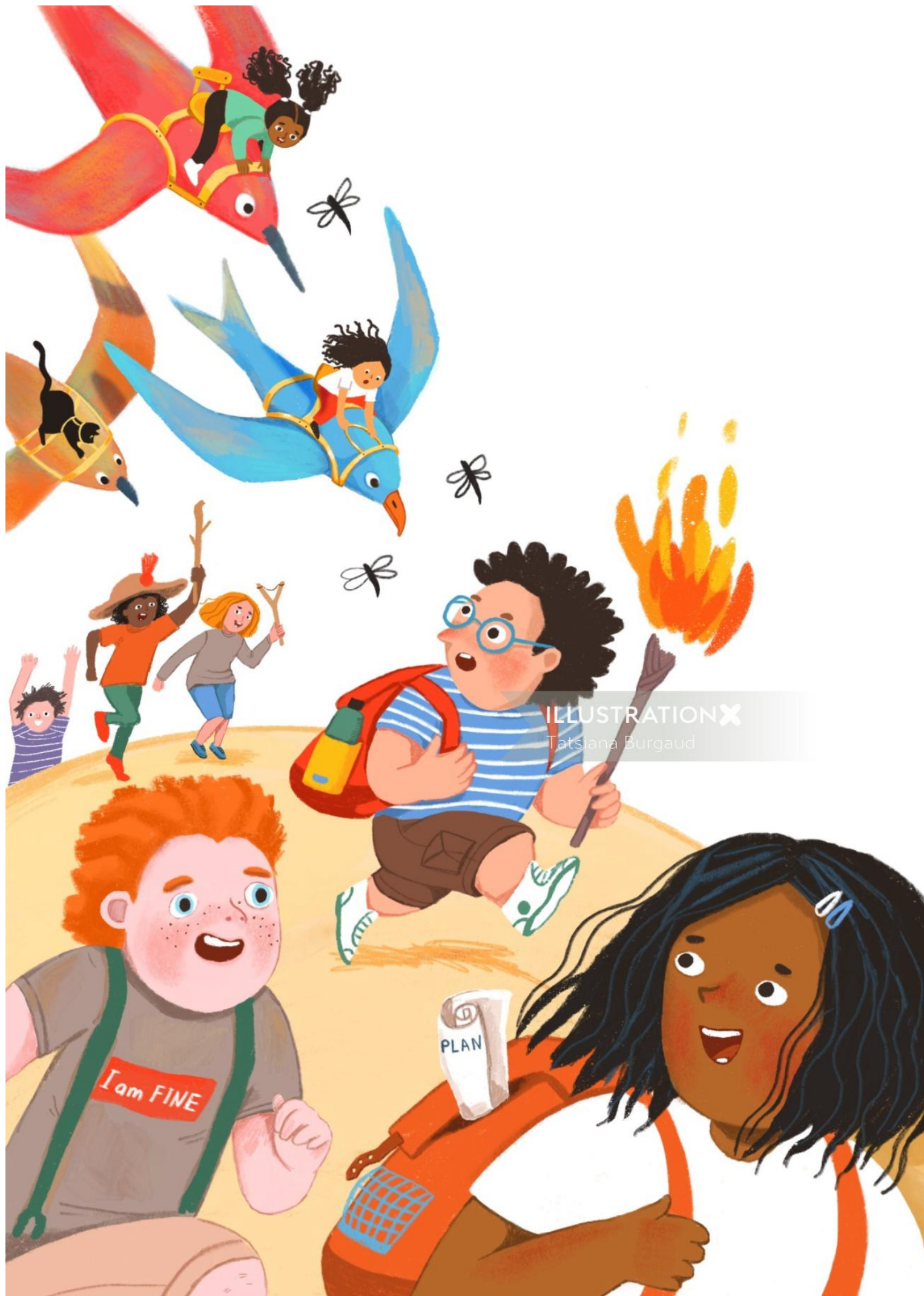
ILLUSTRATION X Tatsiana Burgaud

www.illustrationx.com/sx/TatsianaBurgaud